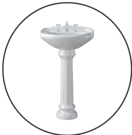
LAVABO CLOAKROOM ROMA PHRM07 + PHRM09CL

” (1 o 3 fori) (1 or 3 taphole) (1 или 3 отверстия)