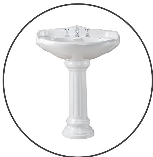
LAVABO ROMA PHRM05 + PHRM09

” (1 o 3 fori) (1 or 3 taphole) (1 или 3 отверстия)