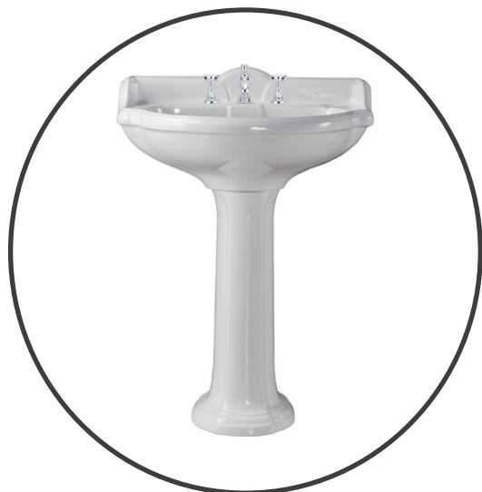
LAVABO POMPEI PHPM05 + PHPM09

” (12 o 3 fori) (12 or 3 taphole) (12 или 3 отверстия)